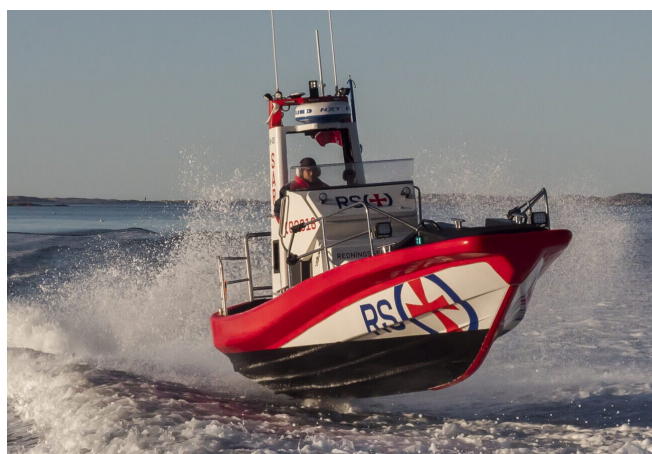
Norwegian rescue boat